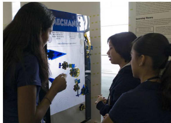
Figure 1. Middle school students using Mechanix.

The design of Mechanix emerged from a review of museum-based engineering installations, which revealed four opportunities for design: (1) Lower cost: Similar exhibits use large displays and expensive touch surfaces [4]; Mechanix uses a low-cost LED projector, webcam, and a magnetic mesh. (2) Combining tangible and on-screen interaction: Many installations rely solely on on-screen interaction [2] despite evidence that tangible interfaces offer a more engaging entry point for children to learn about engineering [3, 8]. Mechanix supports learning through tangible simple machine components and virtual projections of user solutions and formal tutorial content. (3) Trackable, open-ended design challenges: Existing methods for teaching about simple machines tend to rely on scripted curricula, which limit opportunities for children to create their own designs. Mechanix allows for free-form construction and, due to its built-in tracking system, scaffolds designs with recommendations to help learners. (4) User-generated content to facilitate learning: With traditional construction kits such as LEGOs, children often do not have immediate access to others' work and resort to using external references such as online forums. The Mechanix library of exemplars enables novices to view and test others' examples while constructing their own designs.